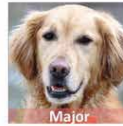
Major (Bo Bowles) Golden Retriever NASAR HRD - Land III (vehicle & building)