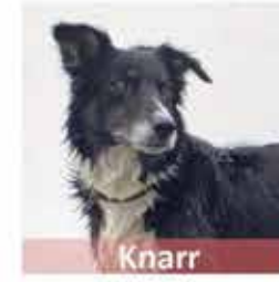
Knarr (TC Crippen) Border Collie NASDN - Basic Trailing; NASAR HRD - Land other