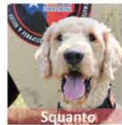
Squanto (Jennifer Faila) Goldendoodle NASAR CST-I Area