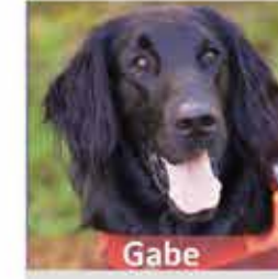
Gabe (Diane Morrow) Flat-Coated Retriever NASAR HRD - Land other, NASAR HRD - water type II, NNDDA