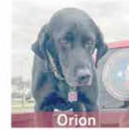
Orion (Joe Huston) Black Laborдор NASAR HRD - Land other, NASAR HRD - Water type 2