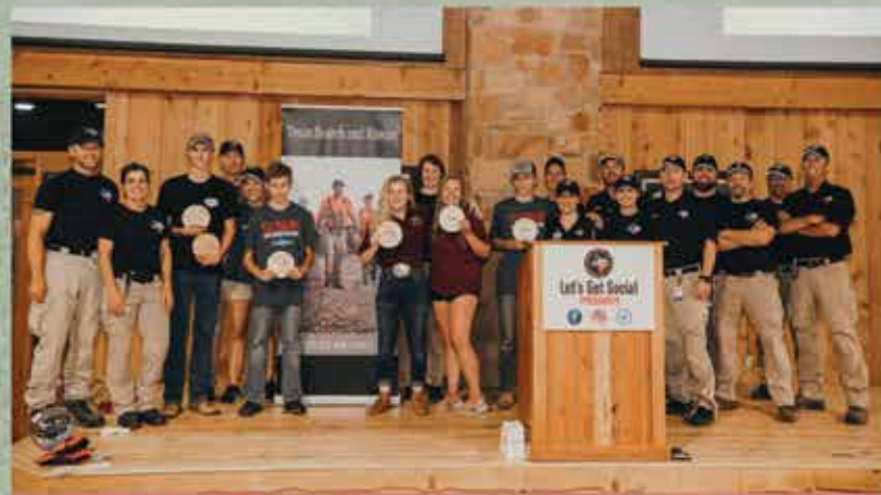
The Dripping Springs Shooting Team swept the event winning multiple awards. We were honored to have a youth team for the first time in event history.

Our sincerest thanks to the Gregory family and Texas Disposal Systems for providing a one of kind venue to host the annual event.