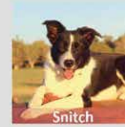
Snitch (Brianna Acevedo) Border Collie NASAR CST-I Area