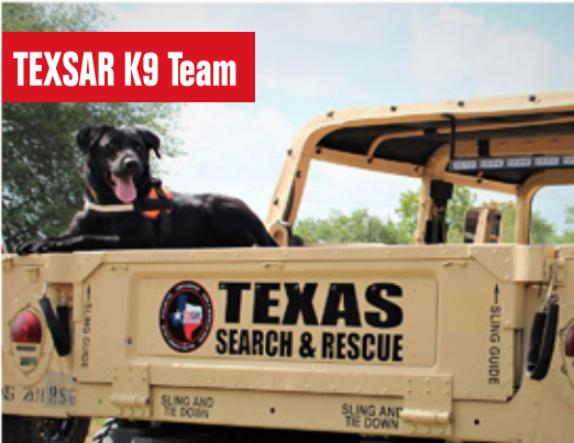
TEXSAR K9 Team

Wildland Fire Disaster Recovery & Relief Evidence/Cold Case Search Underwater Search/Dive Recovery