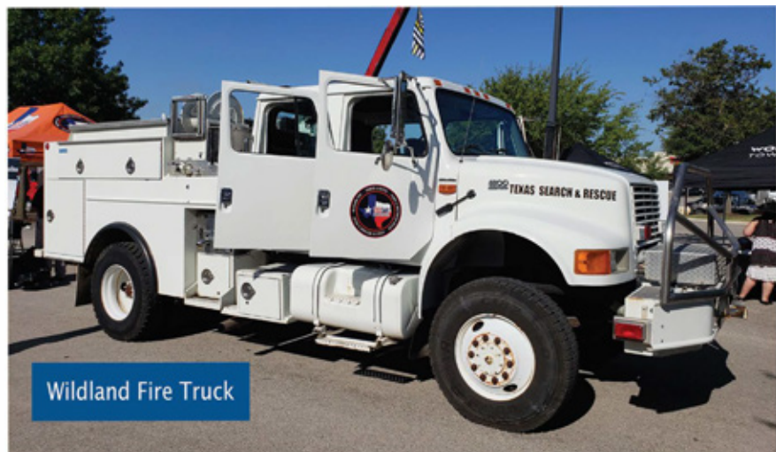
Wildland Fire Truck