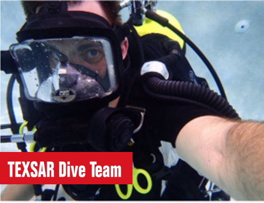
TEXSAR Dive Team

TEXSAR Drone/UAV Assets 5 FFAA Part 107 Licensed Pilots Yuneec H250 with CGO-ET Thermal Camera DJI Mavic Pro Custom Software for squinting/scanning, color range detection, and processing of aerial image Drone use in search and rescue has increased significantly in recent years.