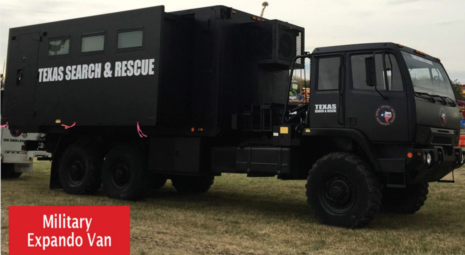
Military Expando Van

Thanks to TEXSAR's generous supporters, the following assets were secured in 2018.